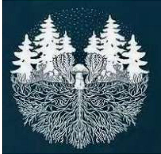
BBC Earthlife T-shirt design showing the Mycelium network with trees

Mycelium, rarely seen, rarely valued but the root of LIFE! The answer to multiple problems now facing the world. Yet it is there, under our feet in the Cemetery and everywhere. So what is it? Why so important? What are its uses?